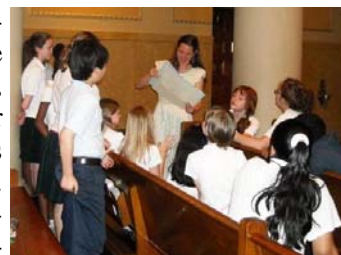
STUDENTS PARTICIPATE IN A LITURGICAL CATECHESIS YEAR-END REVIEW

It is a time of endings and beginnings here at Annunciation, as we continue living out the cycle of the year. In our Church Year, Eastertime has now ended, and we are in a period of time called Ordinary (or Ordinal) Time. Ordinal refers to ordinal numbers, as we count and keep track of the Sundays and weeks. Ordinal Time will continue until the end of November, when we begin a new Church Year the first Sunday of Advent. In our academic year, we conclude the 2009-2010 school year at Annunciation this week. Our kindergartners and eighth graders graduate Thursday, June 3rd, and Friday, June 4th is the last day of school this academic year. Our student body and faculty will join us for 8:00 a.m. Mass Friday morning, and you are also invited to join us to give thanks for all the blessings of this school year.