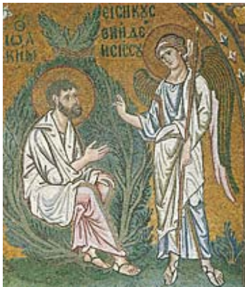
ANNUNCIATION TO SAINT JOACHIM 11TH CENTURY MOSAIC DAPHNI MONASTERY, KATHOLIKON

On Monday, July 26th, the Church celebrates the feast day of Saints Joachim and Anne, parents of the Blessed Virgin Mary, and therefore grandparents of our Lord, Jesus. Neither Joachim and Anne's names, nor their story, are found in the Bible. Yet they have been honored by the Church, and their story has been told both orally and depicted in art, for centuries and centuries. How can this be?